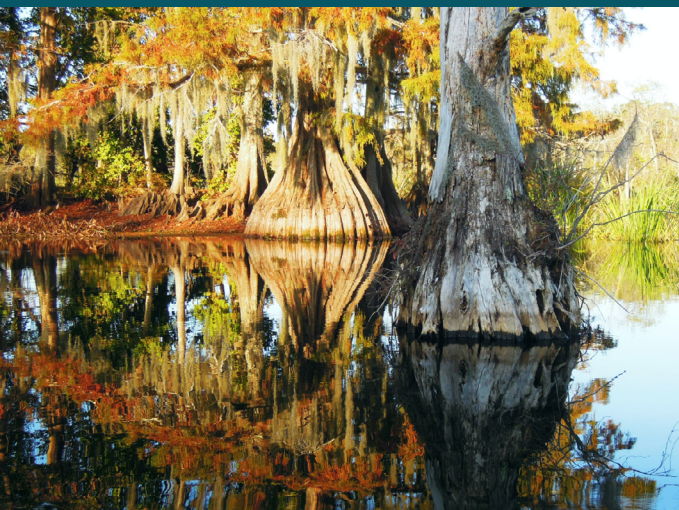
Chicot State Park, Evangeline Parish